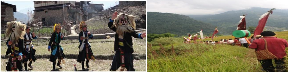
THE VIEW OF VILLAGERSFOR CHOEKOR PROCESSION.

Losar festival is also one of the major festivals of Monpa people, which is celebrated in the last part of February and early part of March every year to commemorate the “New Year”. Group of young people performs Yak and Lion dances from door to door during the festival.