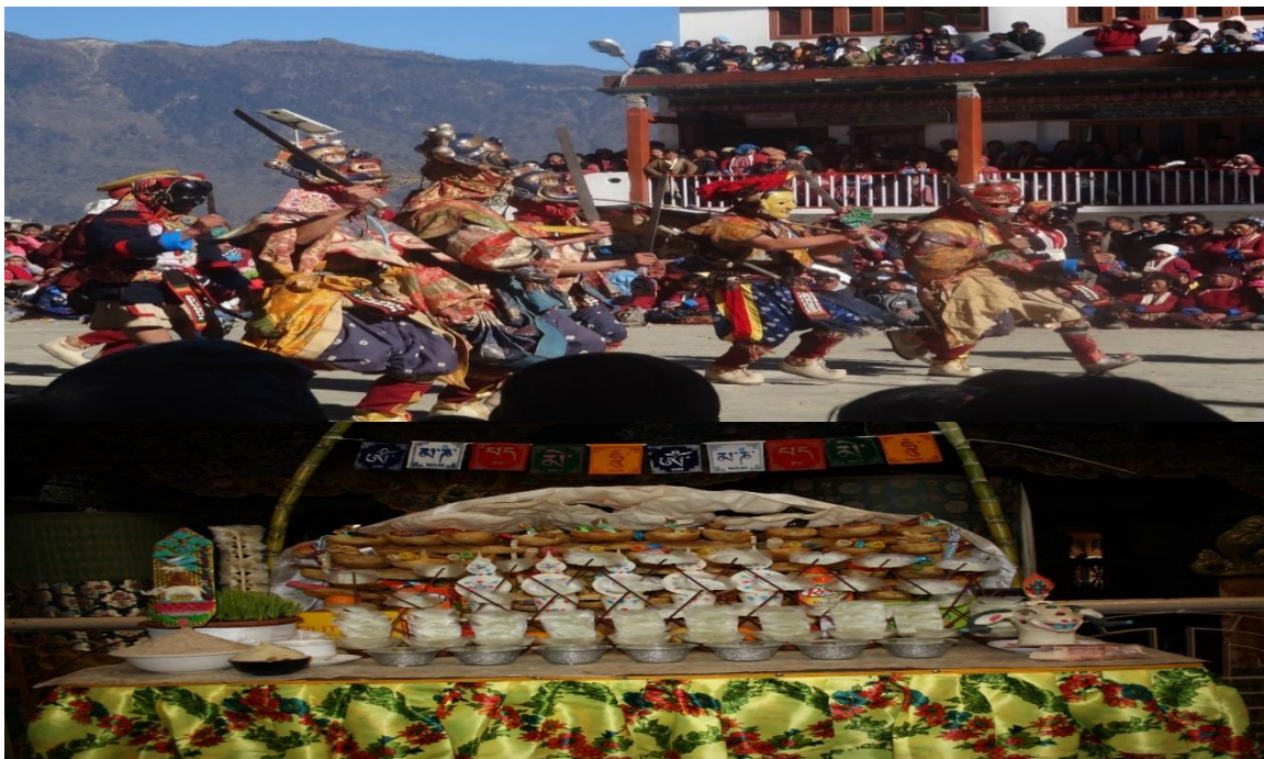
DHERKHA OFFERING DURING THE LOSSAR FESTIVAL

Fairs and festivals have always been an integral part of the Monpa Tribe of Tawang district. The festivals of Monpas are mostly associated with agriculture and religion. Monpas of Tawang district celebrates numbers of festivals every year. Some important festivals are: - Losar, Torgya Dungyur, Choekor, Ganden Ngamchoe, Drukpa Tse-ze and Zhepa Saka Dawa etc.