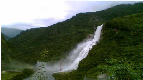
JANG NURANENG WATERFALL

The Tawang district offers idealistic tourism with its majestic snow-clad hills and mountains, green valley of Tawang-Chu and Nyamjang-chu rivers, colorful flora and fauna, fertile Kharsaneng Valley, ancient monasteries and monuments and colorful people having rich tradition. The district has variegated flora and fauna at the alluring peaks of the mountains and down in the green valleys.